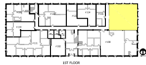
BUILDING KEY PLAN SCALE: N.T.S.